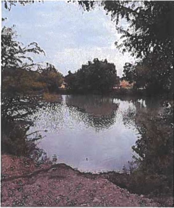
Medina River @ Bandera City Park

440 FM 3240 Bandera, Texas 78003 (830) 796-7260 Fax (830) 816-2607 www.bcragd.org