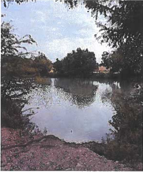
Medina River @ Bandera City Park

440 FM 3240 Bandera, Texas 78003 (830) 796-7260 Fax (830) 816-2607 www.bcragd.org