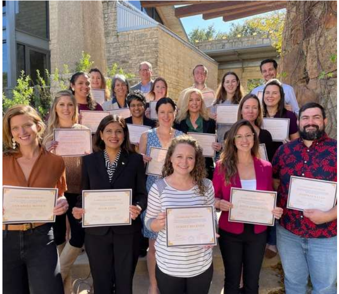
2021 Texas Water Leaders Programs certificate recipients