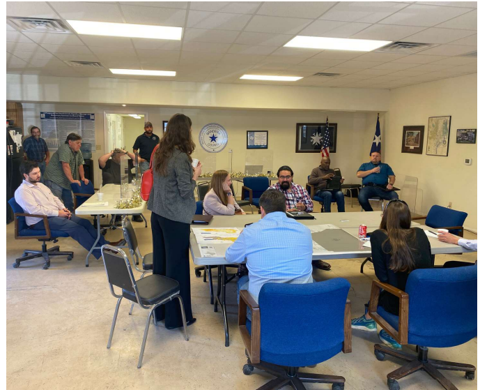
Flyer for San Antonio Region 12 Flood Planning Group