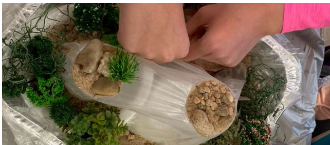
Build your own watershed activity

“Water is the most critical resource issue of our lifetime and our children’s lifetime. The health of our waters is the principal measure of how we live on the land.” – Luna Leopold