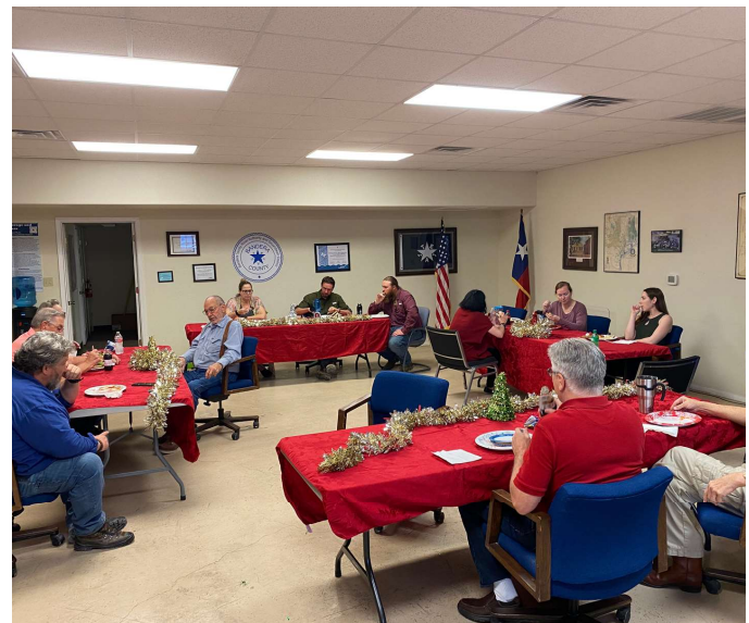
Christmas Conservation Event

On December 16, 2021 Bandera County River Authority and Groundwater District hosted a Holiday Conservation event. The District staff shared information regarding the District's ongoing projects. This event is part of the District's goal to improve inter-governmental relations and work collaboratively with other county and city agencies to better provide services to the community.