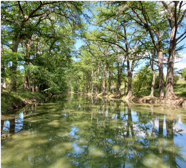
2021 Texas Water Leaders Programs certificate recipients