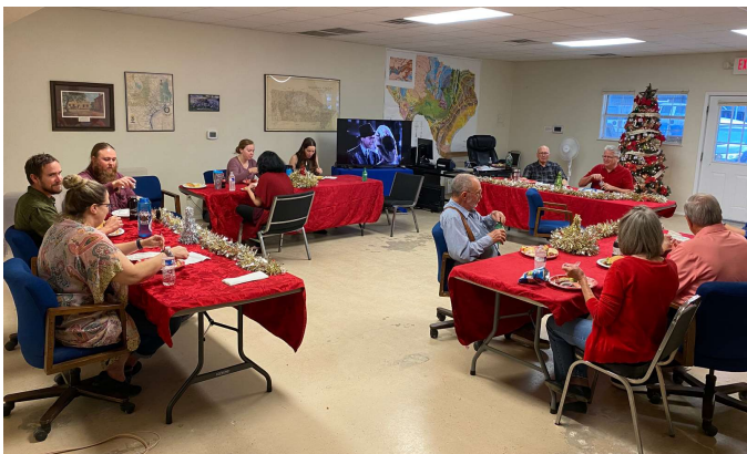
Christmas Conservation Event